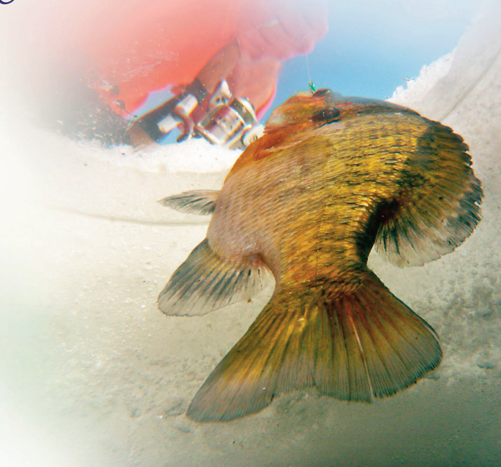
In 2019 the Minnesota Department of Natural Resources surveyed 632 bluegills on Waverly Lake ranging in length from 3-9 inches .

Black Crappie are another sought after species in the lake and