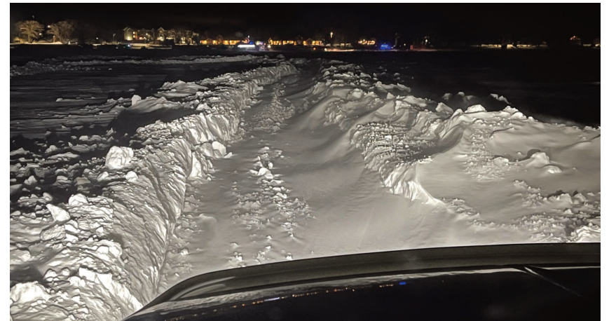
A truck pulling a wheelhouse down this road got stuck on Jan. 22, 2022. Anglers on the lake at the time were unable to get off the lake for over four hours until another road could be opened up by fellow anglers.

Take a snowmobile safety course. It's required of anyone born after 1976 and recommended for everyone. Additional safety tips can be found on the snowmobile safety tips page of the DNR website ( mndnr.gov/snowmobiling/safety.html ).