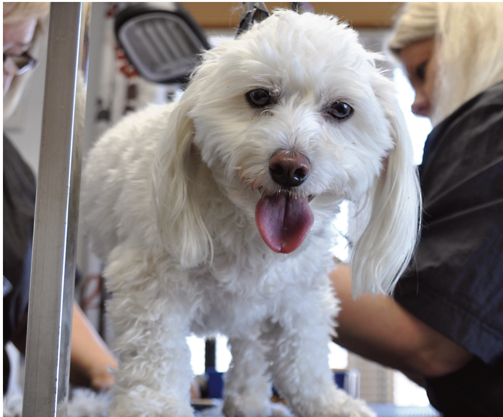
Paws and Claws Grooming on Division Street in Maple Lake will take care of your best friend no matter his or her size. Everyone is happy after a visit.

When it comes to cats their primary cus-