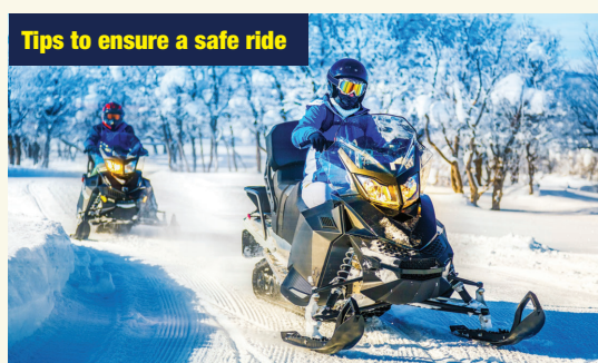
Tips to ensure a safe ride