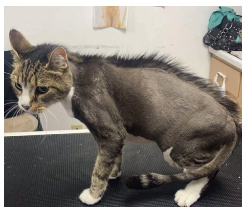
"Gizmo" gets a mohawk cut with a lion tale at the request of his owner.