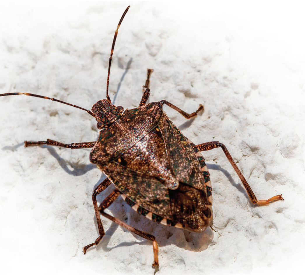
The brown marmorated stink bug, pictured above, can be one of many unwelcome guests invading Minnesota homes and cabins during the winter months.

As the weather cools down, these insects shut down. The same way we think of bears hunkering down and hibernating in a den, stink bugs slow down all their body processes and wait for spring. Most of the time this happens in places in our house we can't see, but sometimes these bugs wake up a little and move around.