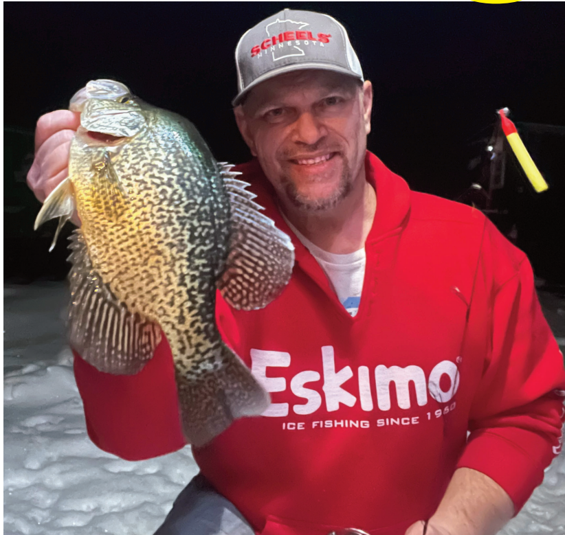
The author caught this 14-inch crappie on January 22 while waiting for a new road to be opened up on a nearby lake.

Recent snowfalls, wind and drifting have made it tougher on anglers looking to get out and off main roads and beaten down trails. Lakes also contain areas that may have flooding due to the heavy