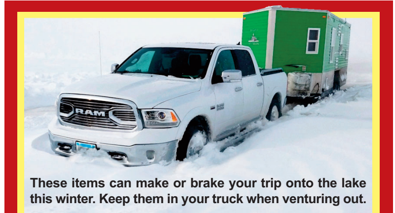
These items can make or brake your trip onto the lake this winter. Keep them in your truck when venturing out.

by the hour, and some lakes are a series of mazes with dead end roads and no place to turn around. After scouting dozens of lakes, I have chosen to fish within a community of friends experiencing many of these same problems. The peace-of-