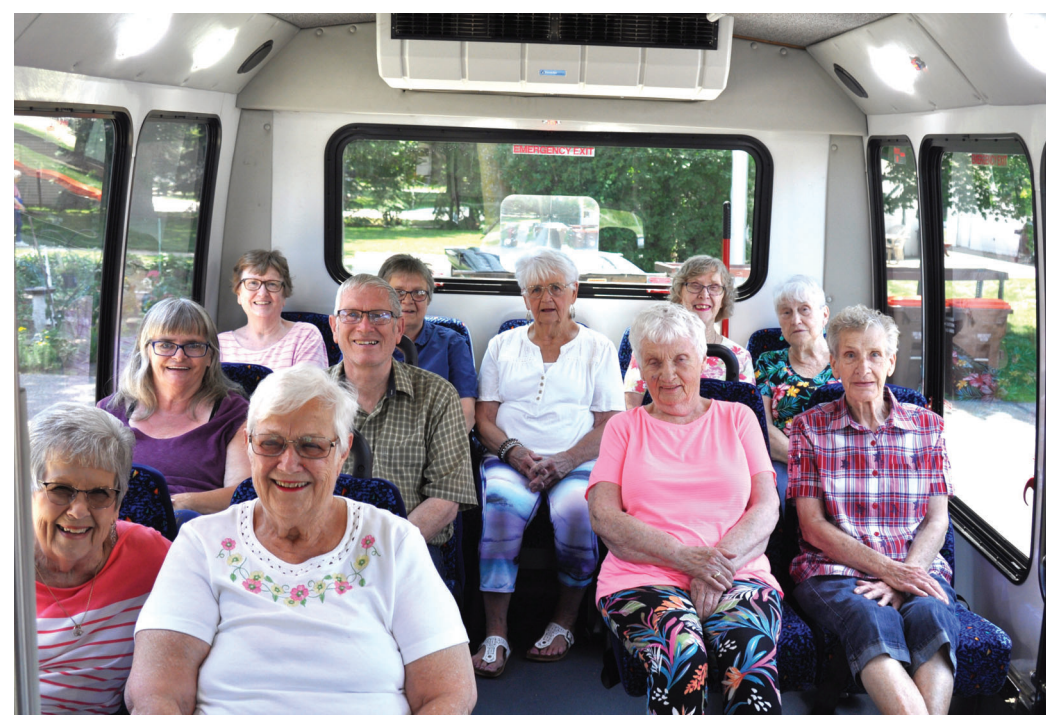
Trailblazer Transit is used for a variety of reasons including getting to and from doctor's appointments, pharmacy visits, grocery shopping and social activities.

we insure your car. because some people never learned to park. simple human sense