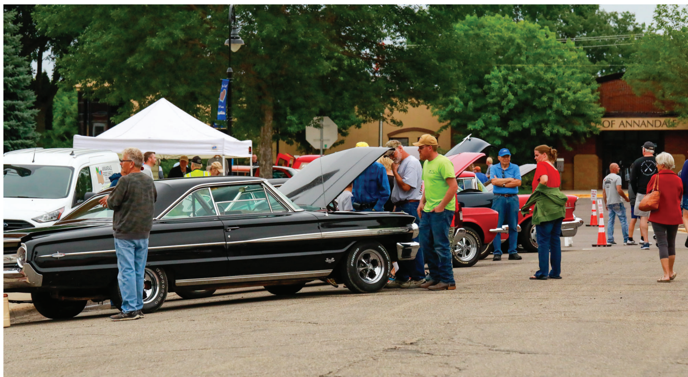
Auto enthusiasts gather near Annandale City Hall to check out these throwbacks to the past.

Organizers encourage bringing a foodshelf item. The event is sponsored by the Annandale Area Chamber of Commerce.