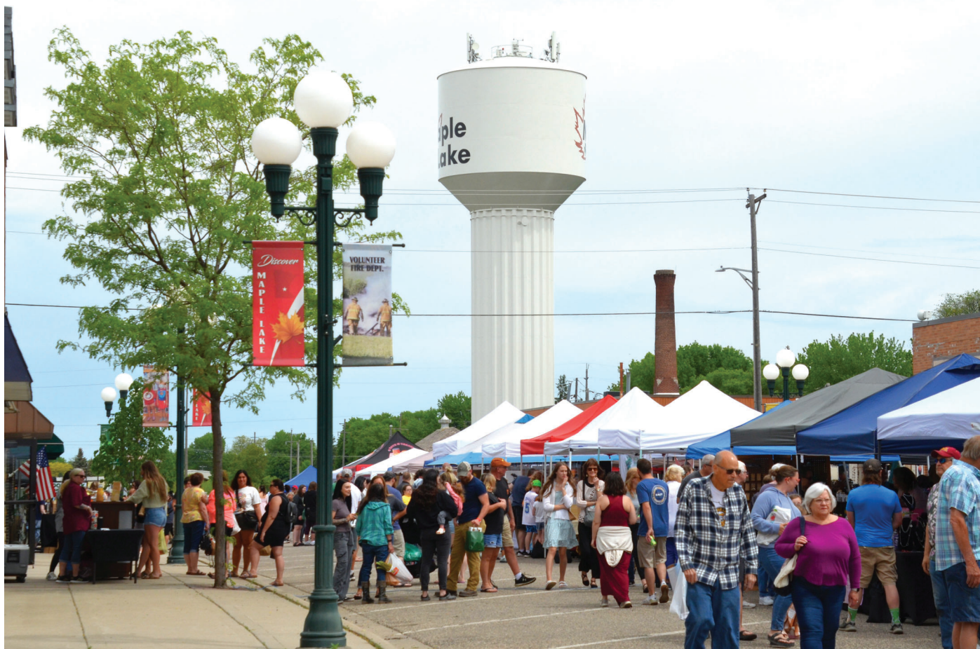
The Makers and Growers Market returned to downtown Maple Lake on Sunday, May 19. This monthly market features everything from fresh produce to fine arts and takes place one Sunday out of every month, May through October, from 10:30 a.m. until 3:30 p.m.

The event is free to vendors and shoppers, but the committee asks all to consider making a free will donation at the registration desk to keep the event alive and successful.