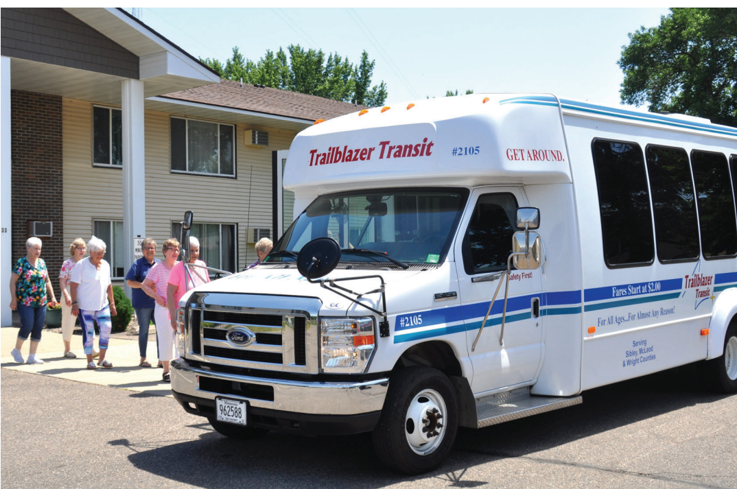
In 2023 Trailblazer Transit gave 230,000 rides throughout its service area. The organization is looking to improve upon that by hiring career-minded individuals who love to drive and want to make a difference.

"Trailblazer Transit is here to help improve the quality of life for our communities, whether that means providing access to a job, grocery store, doctor's office, or the opportunity for