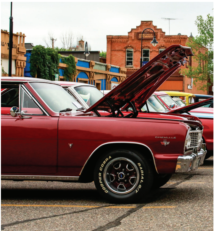
See classic cars at the monthly Annandale Cruise Ins Friday nights this summer, June 14, July 12, Aug. 9, and Sept. 13 from 8 to 5 p.m.