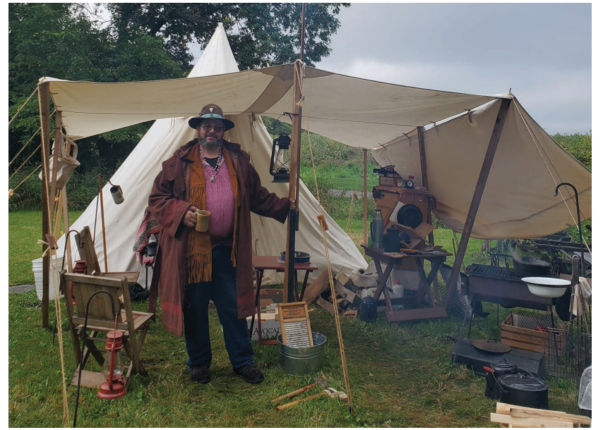
Enjoy a little bit of history this summer at Minnesota Pioneer Park located along Highway 55 in Annandale.

For more information visit Pioneer Park's website at www.pioneerpark.org , email pioneerp@lakedalelink.net or call 320-274-8498.