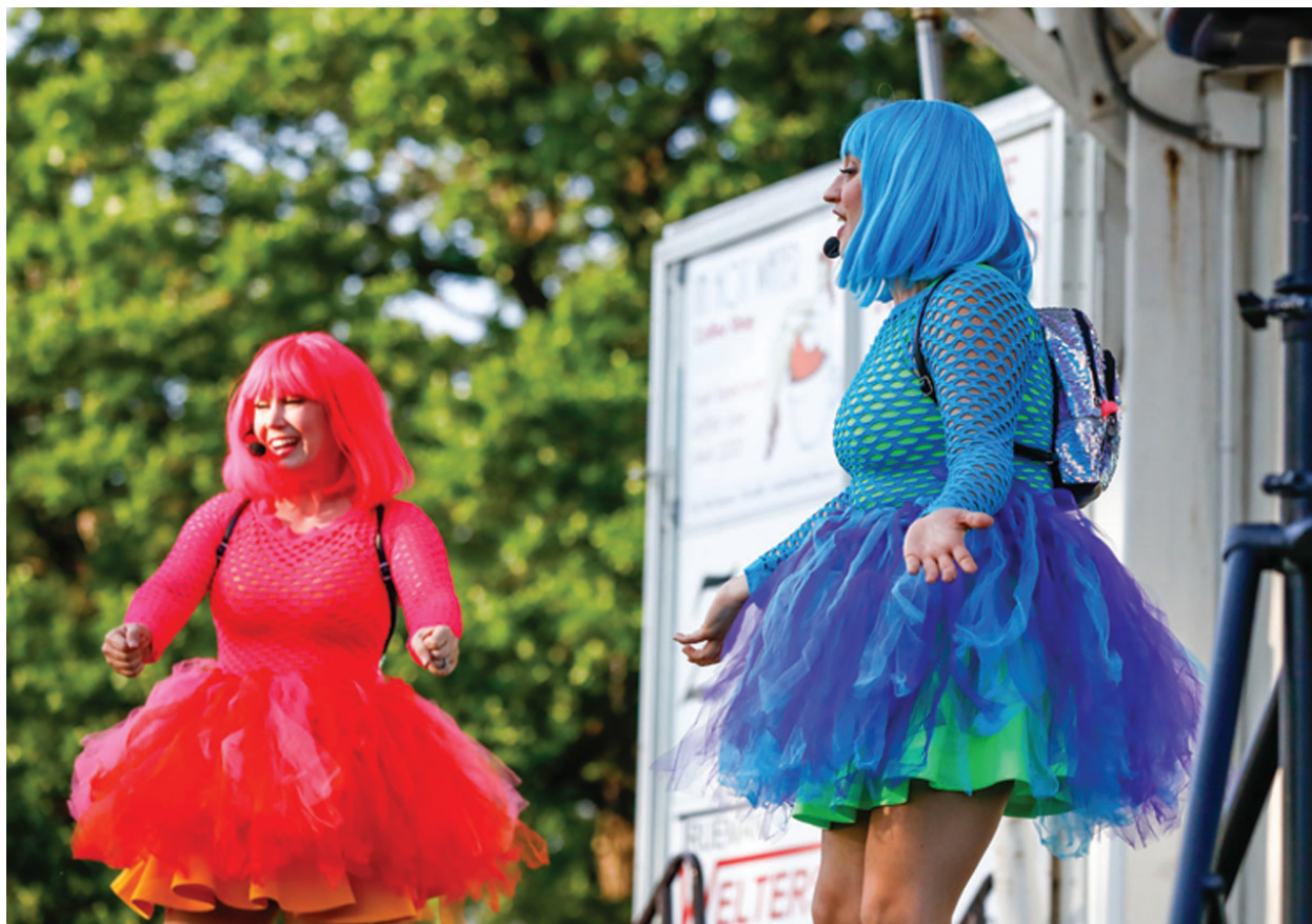
Annandale's Summer Concert Series begins June 21. Enjoy a variety of live music on Friday nights by the lake throughout the summer.

The band celebrated its 30th year in 2023. The band performs a wide-ranging show that everyone will enjoy.