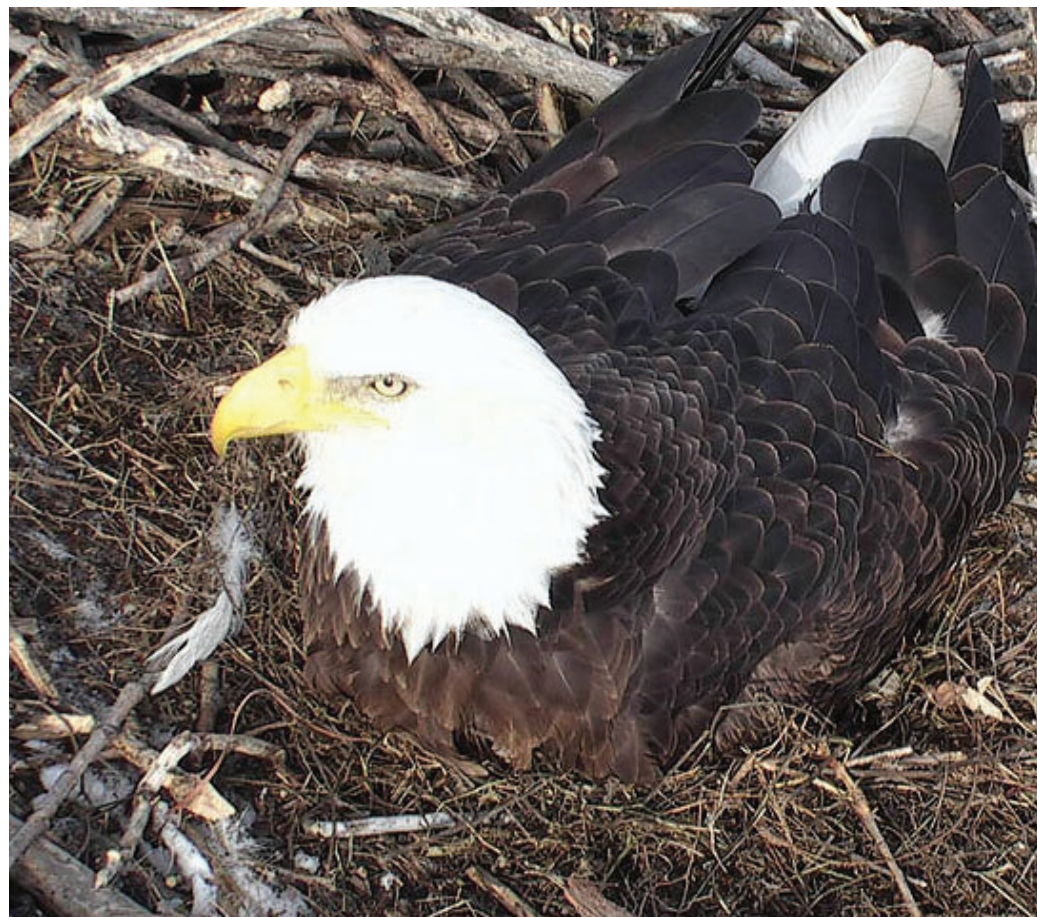
The DNR's EagleCam focuses on the nesting behavior of a breeding pair of bald eagles that have successfully and consistently nested in the area for at least four years.

The DNR EagleCam goes live each November to show the eagle pair courting each other and upgrading their nest. They bring in new nesting material and large sticks each year as a bonding activity. The pair typically increase their activity at the nest as winter progresses and normally by mid-February will have two or three eggs, which the adults incubate for about 35 days. Both adults participate in incubating the eggs and caring for the chicks. Once the chicks hatch, the camera zooms in closely to follow the delicate process of raising bald eagle chicks.