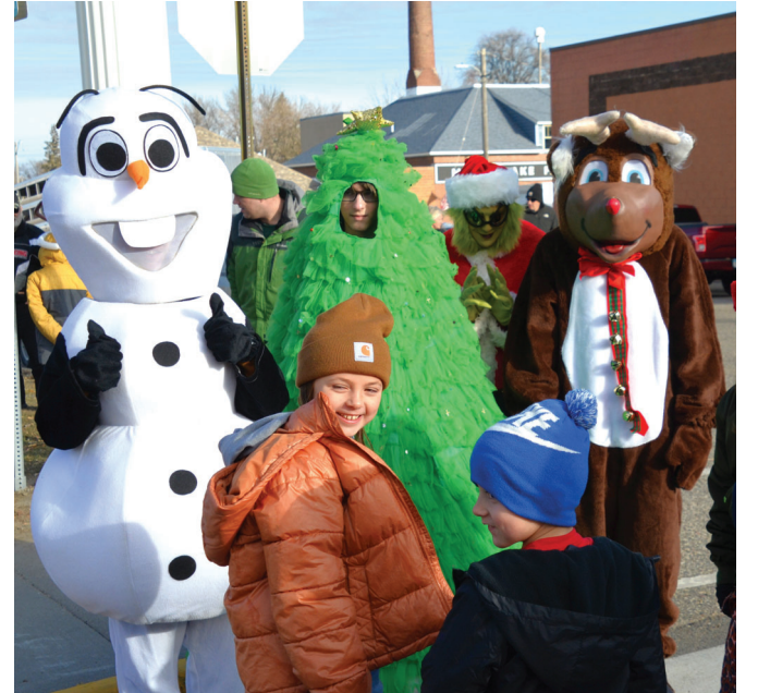
Tikes will once again have the chance to see real-live reindeer courtesy of Bluestem Reindeer Ranch and well known holiday characters roaming the streets will give kids a thrill at Christmas in Maple Lake.

Christmas in Maple Lake has been a tradition looked forward to by the children in this community for almost 20 years. For many years it was held inside at the elementary school. A few years ago, organizers moved it downtown to show off the city's unique downtown while promoting local businesses.