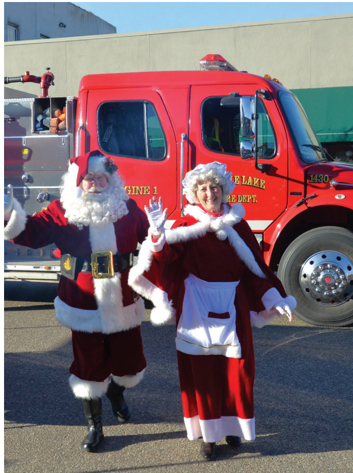
Santa and Mrs. Claus will arrive by fire truck at 10 a.m. Saturday morning, Dec. 7 outside Sunfish Dental on Birch Avenue and be available for pictures inside the dental clinic until noon.

Meet Santa and his reindeer on December 7 at Christmas in Maple Lake