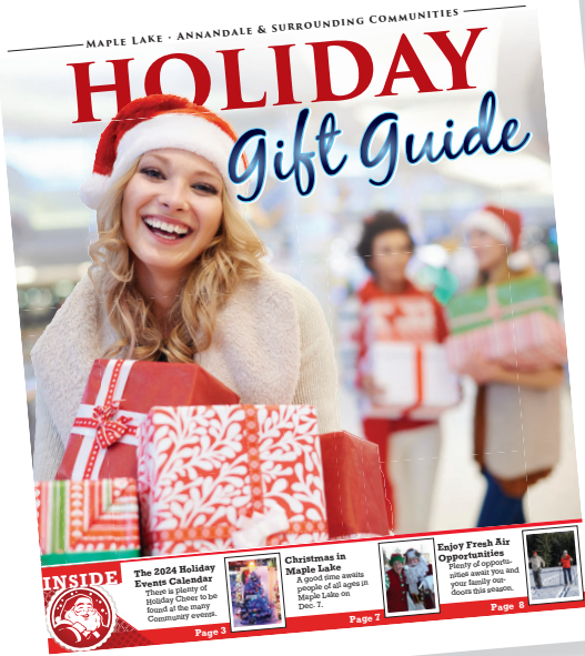
The Holiday Guide can be found in the Nov. 27 issue of the Maple Lake Messenger and Annandale Advocate.

The 23-year-old Springsteen has been called by E! News "one of Nashville's most buzzworthy emerging artists," while PEOPLE deems Springsteen "the future of country music." Delivering crossover collaborations with Tiësto and William Black, she's surpassed 221 million