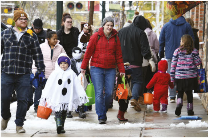
The Chamber Business Trick or Treat takes place Oct. 31st.