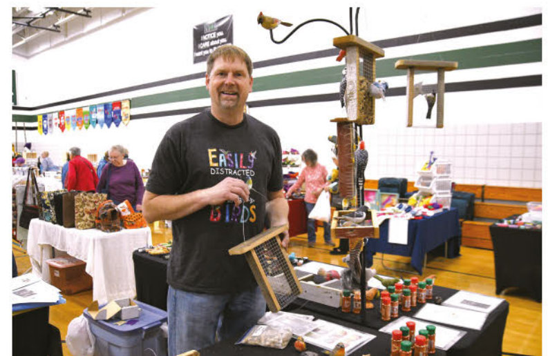
The Chamber sponsors a craft fair in the fall and in the spring in conjunction with the St. Patrick's Day Festival.