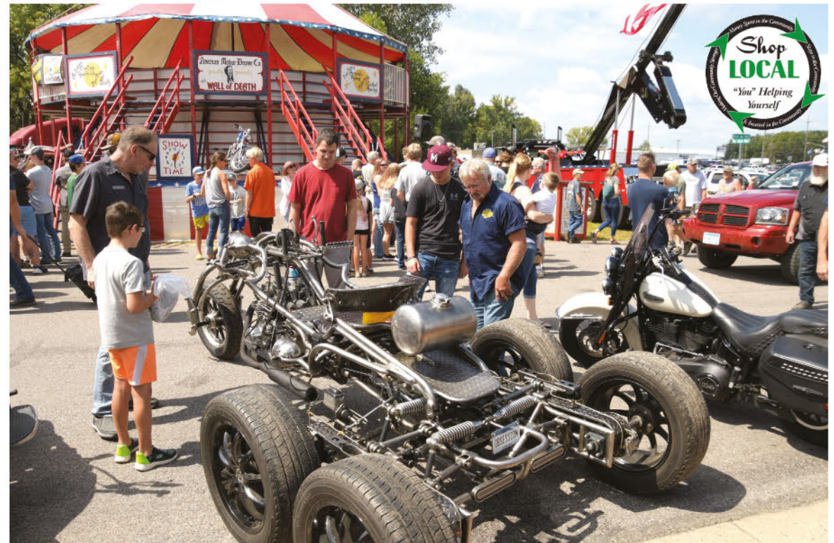
The Gear-Head Get Together and Swap Meet attracts thousands of people to Maple Lake on the third Saturday in August. The 14th Annual Gear-Head Get Together is set for Saturday, August 16th.

Another new event the Chamber is introducing this winter to draw more people to the community and its businesses is the Snowmachine Rendezvous and Ride. Organizers are already calling this their "winter Gear-Head" and like the oh-so-popular August festival, this show is all about peo-