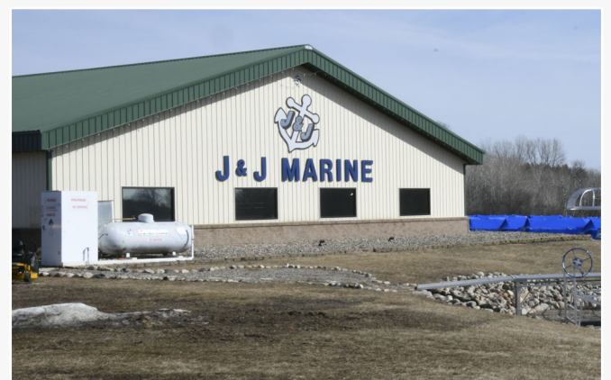
Located just west of Annandale on Highway 55, J&J Marine sells docks, lifts, new and used boats. The company also services equipment and offers boat storage.