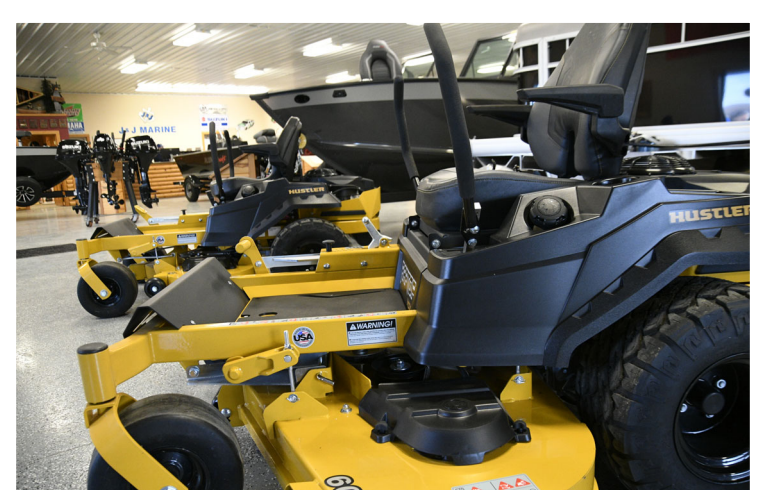
J&J Marine is also a Hustler lawnmower dealer.