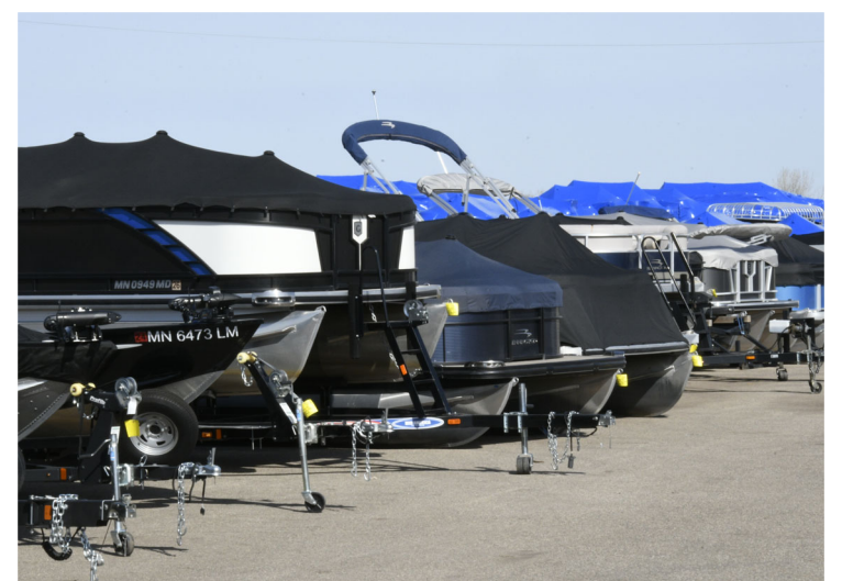
J&J Marine has a large selection of used boats to choose from on their outdoor lot.