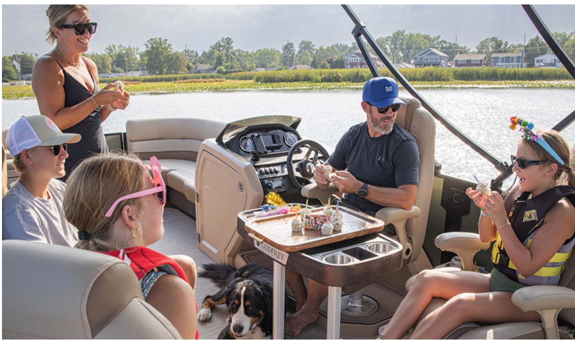
J&J Marine specializes in Godfrey Pontoons like the one above. Owned by Minnesota-based Polaris, Godfrey is considered one of the best built pontoons on the market.