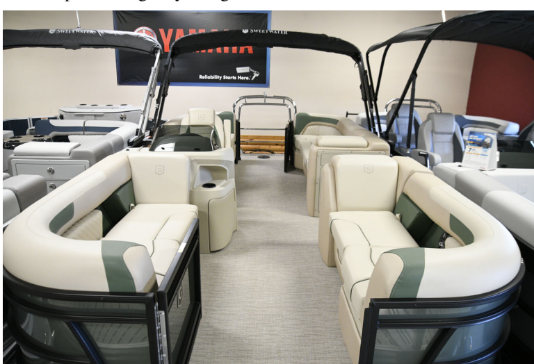
Check out a Godfrey Pontoon at the J&J Marine showroom. Pick out one that fits your family this spring and start creating memories that will last a lifetime.

J&J Marine carries four major outboard motor brands: Yamaha, Honda, Mercury and Suzuki. They also carry a full line of parts, accessories and the latest in fishing electronics at their location off Highway 55 west of Annandale.