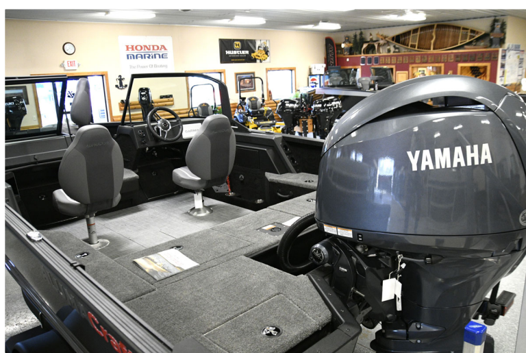
New this year from Alumacraft is the Competitor X model fishing boat. It's bigger, more comfortable and quieter than previous generation boats.