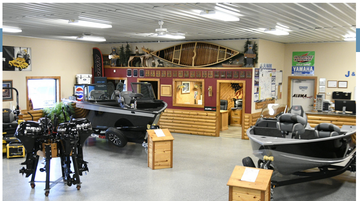
Check out a new Alumacraft fishing boat or Godfrey pontoon at J&J's 6,000 plus foot showroom. J&J also carries motors, fishing electronics and boating accessories.

If you are in the market for a boat this spring, J&J Marine offers a low-pressure buying process. Travis likes to think of it as a fact-finding journey for the cus-