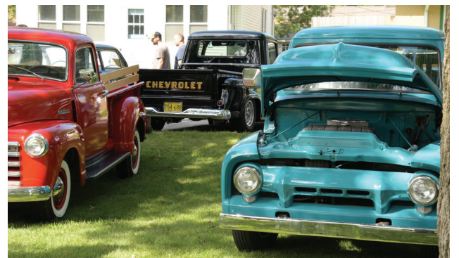
August 16 - Gear-Head Get Together & Swap Meet

the streets and throughout the neighborhoods of Maple Lake.