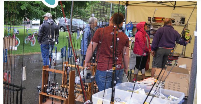
June 7 - Maple Lake Chamber All City Garage Sale

On June 7, the Chamber hosts the All City Garage Sale. From early morning until late afternoon, find bargains up and down