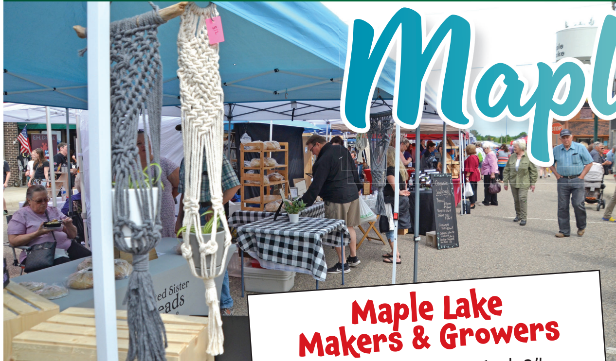
Maple Lake Makers & Growers Market