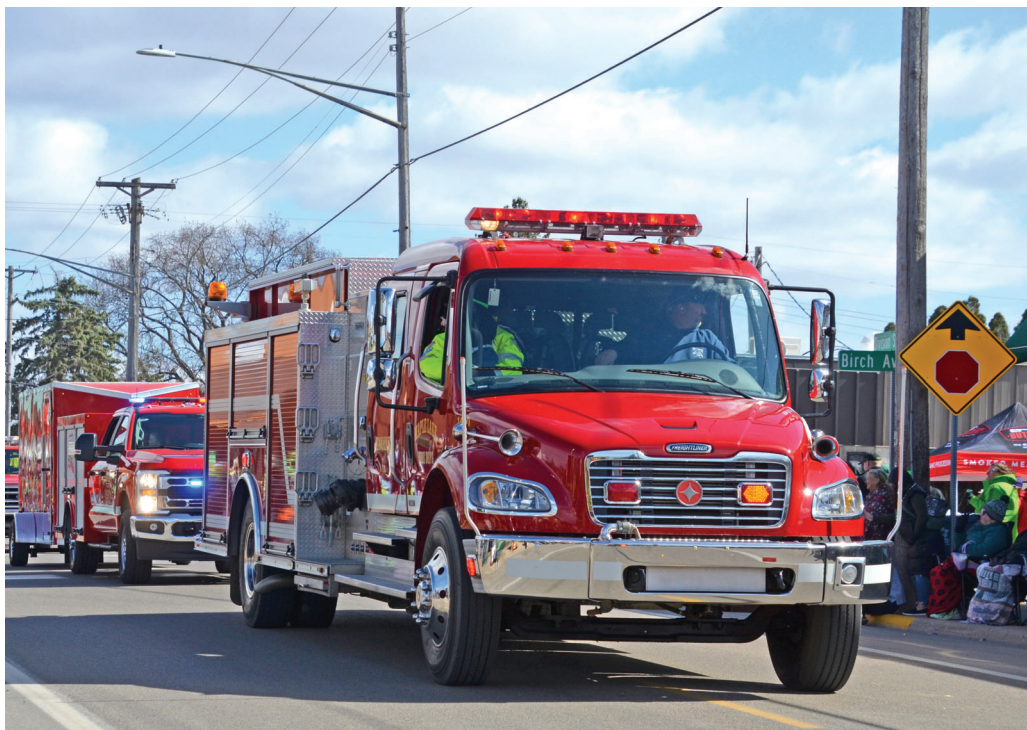
The Maple Lake Fire Department serves the City of Maple Lake and the townships of Albion, Corinna, Chatham, Maple Lake, Marysville and Silver Creek. Above, the fire department takes part in Maple Lake's St. Patrick's Day Parade.