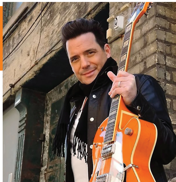
Robby Vee, the son of late-great 1960s rocker Bobby Vee is known as “The Prince of Twang.”