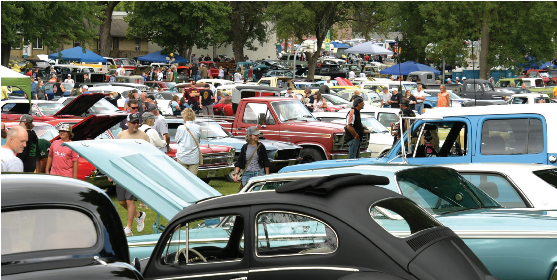
This was the view from the Community Park at last year's Get Together. The display of cars and machines continued down Division Street and onto Birch Avenue downtown by the empty lot. Organizers expect as many or more this year.