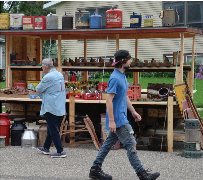
If you are looking for automotive collectables, try the Gear-Head swap meet. You might find something interesting.

So, bring your wallet and empty the bed of your truck. You may be going home with something you've been searching for, or something you never knew you needed.