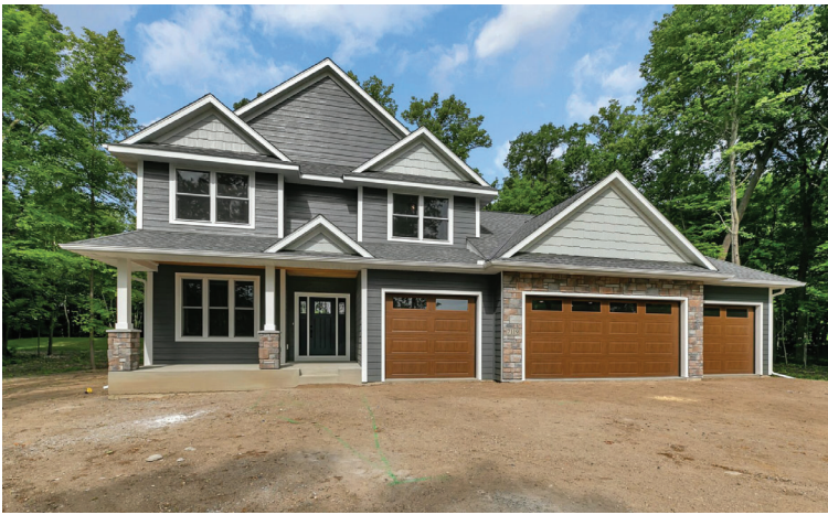
Maple Lake Lumber construction specialists can put you in touch with trusted contractors who know how to do the job right.