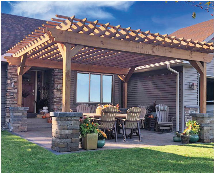
When you visit Maple Lake Lumber you have the choice of one of several construction specialists who will help you plan, design and estimate the cost of your project whether you are building a new house or a new patio. Photos submitted

contractors, has been proven time and again over the last 60 years, and with any luck, it will continue for many years to come. For more information on Maple Lake Lumber Co.’s products and services, stop in, give them a call at 320-963-3612, visit them on-line at MapleLakelumber.com , or like them on Facebook to get current sales or information.